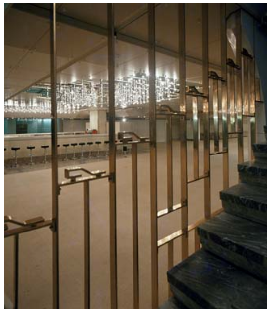
Cankarjev dom, original entrance hall in first underground level