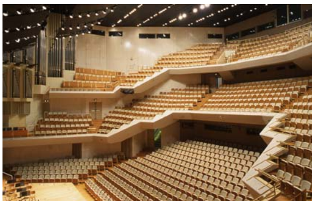
Cankarjev dom, original Gallus hall