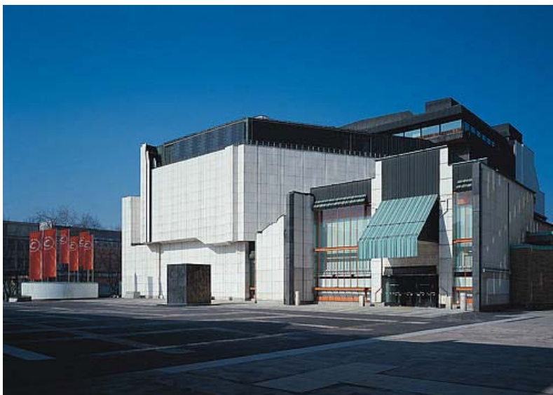
Cankarjev dom in Ljubljana, designed by Prof. Edvard Ravnikar in 1977

Cankarjev dom needs to be renovated. Unfortunately the director of Cankarjev dom and the architect exhibit a fundamental lack of understanding and respect towards Ravnikar's original design. Instead of protecting it, they have used the renovation to completely remove Ravnikar's existing interiors. Their attitude toward Ravnikar's work is shown through their previous renovations: the redesign of the first and second entry hall, Kosovel hall and Club CD; changing the proportion of the spaces, original materials, colors and details.