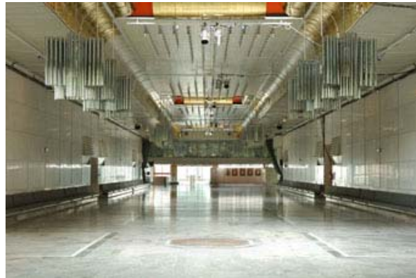
Cankarjev dom, original main entrance hall

Official representatives of Slovene architectural institutions and associations wrote an appeal letter to Slovene Ministry of culture – the owner of Cankarjev dom – to stop the renovation and to urgently protect the building and its interior. To date our letter has had no success.