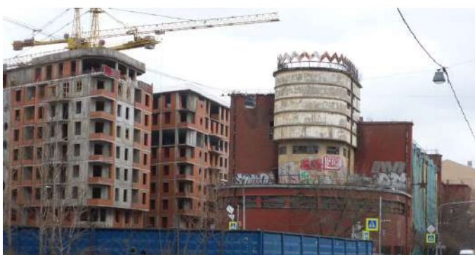
Erich Mendelsohn, Red Flag Textile Factory, St. Petersburg, Russia, 1926. Current state of the ensemble.