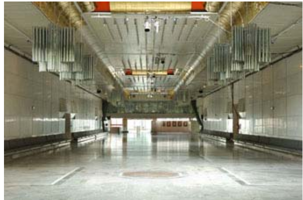
Cankarjev dom, original main entrance hall

Official representatives of Slovene architectural institutions and associations wrote an appeal letter to Slovene Ministry of culture – the owner of Cankarjev dom – to stop the renovation and to urgently protect the building and its interior. To date our letter has had no success.